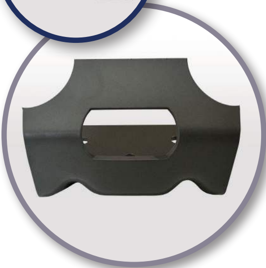
Galvanized G-90 steel